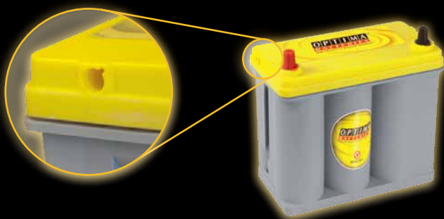
More Reserve Capacity keeps your accessories running longer

Direct fit replacement. Vent and terminal designs fit Prius.